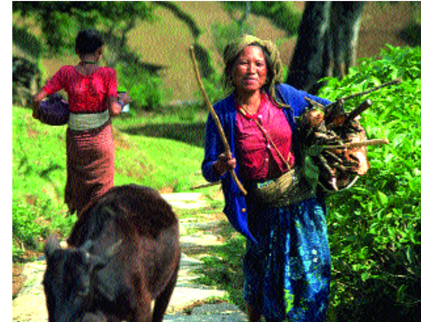
Local needs for fuelwood, grazing and other things need to be accommodated to halt deterioration of forests.

Therefore, in the past 30 years or more, there have often been self-initiated local actions to stabilize use of forest resources or to increase supplies of forest products. This has been paralleled by changes in the