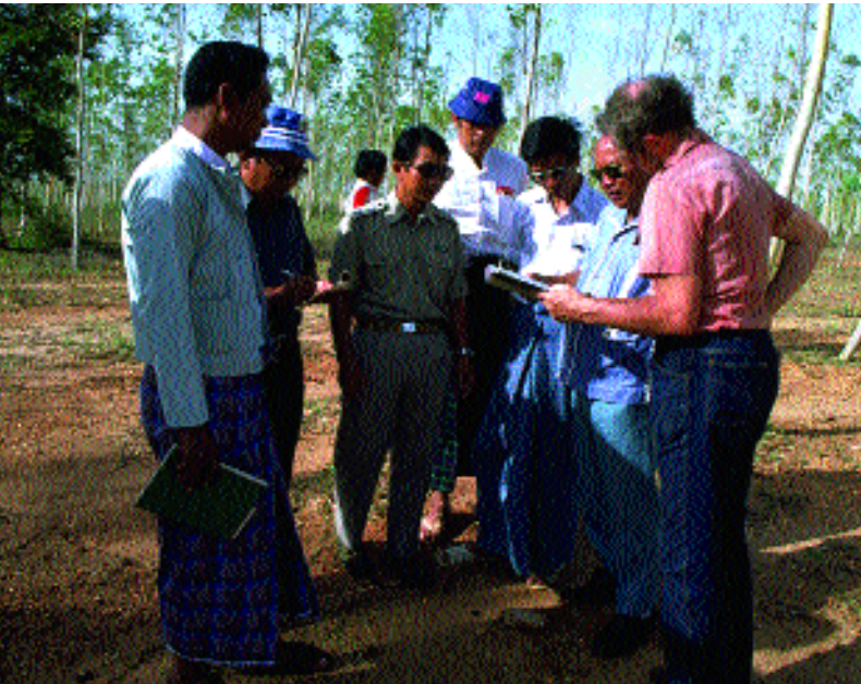
A forester meeting with villagers. It is becoming increasingly clear that, in order to be effective, local forest management is going to need a high level of support.

more. Even relatively well-developed local institutions are likely to encounter difficulties in taking on responsibilities for environmental management tasks previously performed by the central government. When there are competing or conflicting claims on the resource that involve stakeholders from outside the community, issues may arise that need access to external sources of arbitration and management to resolve. Though one of the arguments for devolution of responsibilities to local institutions was that this would reduce the costs of forest management, it is becoming increasingly clear that, in order to be effective, local forest management is also going to need a high level of sup-