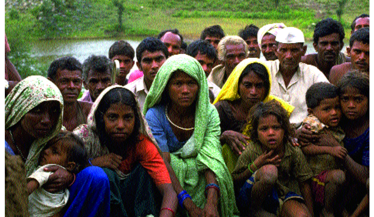
As the use of forest resources becomes increasingly determined by market forces, more attention will need to be paid to ensuring that the poorer can continue to participate.

Another impact of such macroeconomic and policy change has been the acceleration of the process of exposing community-level producers of forest products to market forces. As discussed above, this can both create additional opportunities to generate income and also heighten pressures on local institutions attempting to manage a resource as common