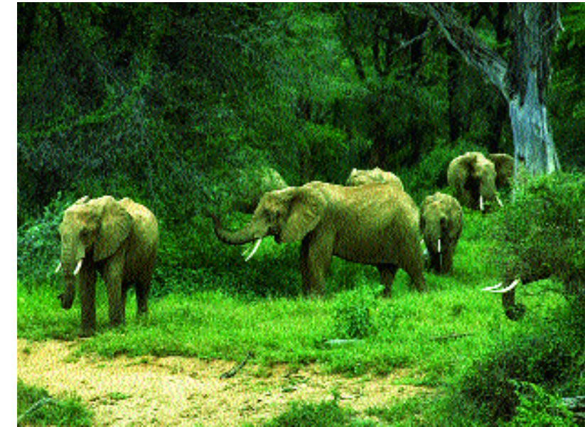
Some communities have formed joint ventures with the private sector in order to generate commercial revenues from wildlife resources.

In some situations, more complex mechanisms that can cope with additional dimensions have been successfully developed. In some, these involve setting up separate arrangements for the subsistence and commercial activities based on a collectively controlled resource. In the Sukhomajri project in the Shivalik Hills in northern India, for instance, fodder grass for local self-use is protected collectively and distributed to all member households, while the rights to commercially valuable bhabbar grass are auctioned to private contractors (Saxena, 1997). In the Communal Areas Management Programme for Indigenous Resources (CAMPFIRE) programme in Zimbabwe, communities have formed joint ventures with the private sector to get access to the specialized safari and hunting skills and experience needed to generate commercial revenues from the wildlife resources that they manage (Murphree, 1996). In