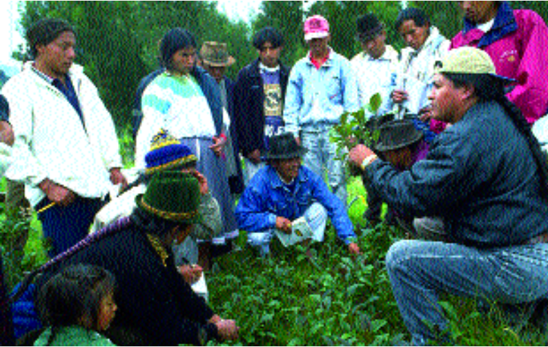
A forester working with a farming association in Ecuador. There have been steadily growing pressures to increase the participation of local people in forest management.

to reflect responses to growing shortages of forest products and other forest outputs of value to the user community, or to reflect increased pressures from outside interests to use forest resources that are still important to the community, and they were found to be where user communities are still relatively stable and cohesive. Increased recognition of the continuing role of forests as common pool resources, and of such local initiatives in management, contributed to the revival in interest in local collective management that is reflected in recent government and donor initiatives of the kind discussed below in this publication.