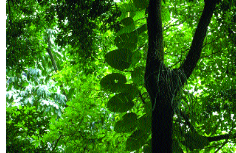
Can community forestry be made compatible with conserving global values, such as biodiversity and carbon sequestration, of tropical rain forests?

Thus, there is growing acceptance that the pursuit of conservation has been too much driven by northern concepts and donor preoccupations, at the expense of those who depend on forests locally. It is therefore quite likely that the conservation objective for community forestry will progressively shift from a predominantly protective orientation towards encouragement of sustainable systems of producing livelihood benefits in as environmentally friendly a way as possible (Freese, 1997). For example, this could be done by encouraging options that result in landscapes like those found in parts of Southeast Asia, which maintain a patchwork, or