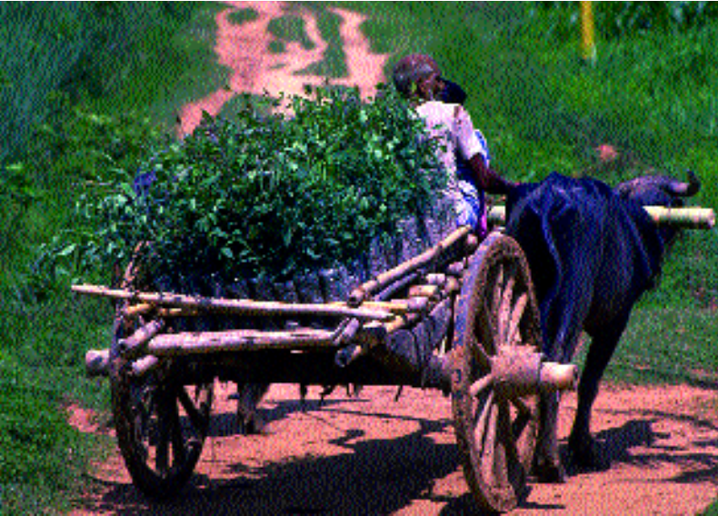
A farmer transporting tree seedlings for planting on his land.

ers' decisions about growing trees are usually found to be influenced more by economic than by tenure considerations (Current et al. , 1995; Shepherd, 1992; Godoy, 1992).