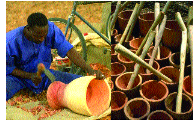
Woodworking to make mortars and pestles for the market.

In recent years, a number of initiatives have been launched to encourage trade in particular forest products for industrial or niche export markets. However, such product trades have often been driven by "donors and NGOs who form enthusiasms [for] various 'silver bullets' ... that are hoped to be environment-friendly and income boosters" (Hazell and Reardon, 1998). Many have proved to be susceptible to change in market requirements, to domination by intermediaries and to shifts to domesticated or synthetic sources of supply, and they have consequently not been sustainable. Therefore, they can expose rural households to high levels of risk, particularly when the trade has encouraged people to move away from more diversified and less risky agriculture-based livelihoods, as with some of the extractive product trades from the Amazon region (Browder,