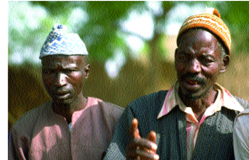
It has been argued that some rights of local users are paramount and should not be subject to negotiation.

Given the political weakness of many local user populations, there is thus a danger that they will be unable to participate in an equitable manner. It has been argued that some rights of local users are paramount and should not be subject to negotiation, and that immersion in a system subject to the agreement of other interested parties could conflict with local