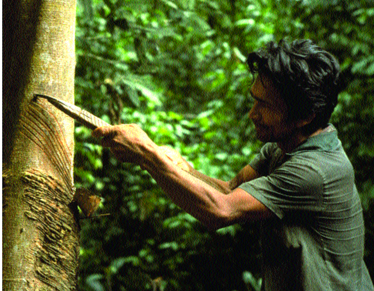
Tapping trees for gum-milk in Brazil. Several studies have argued that harvesting of non-timber forest products by local people is less ecologically destructive than timber harvesting.

growing environmental concerns about the conservation of forest biodiversity, and developments related to the management of protected areas. At the 1982 World Congress on National Parks, it was recognized that these could only be protected if the conflicts that arose when people who relied on use of the resources in these areas were excluded from them were addressed. This led to the development of programmes to introduce new livelihood activities in, and adjacent to, protected areas that would compensate those living in them for the loss of use, and encourage them to participate in the protection of the resource (Fisher, 1995; Wells and Brandon, 1992).