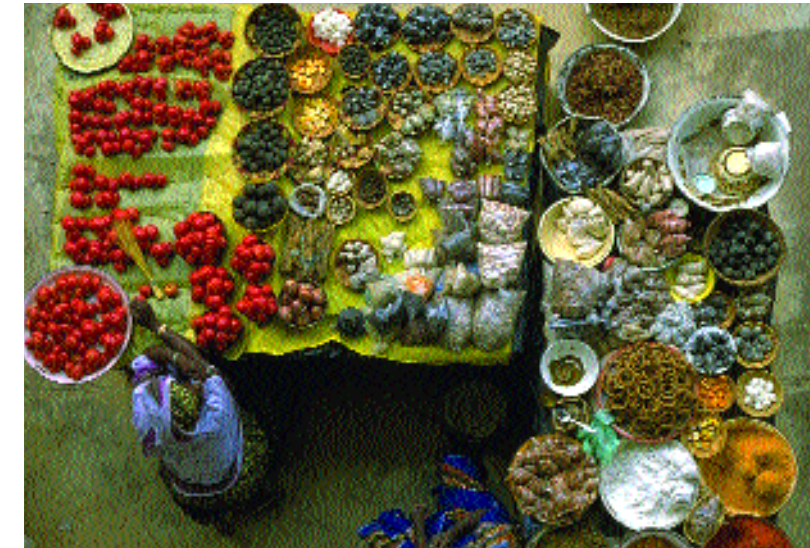
In West Africa, local forest management usually involves commitments, such as protection and planting, in exchange for rights and benefits, such as the right to harvest and sell forest products.

Devolution in these countries has usually involved village chiefs or rural councils. However, chiefs, who are chosen by government-sanctioned processes, are often effectively part of the administrative system. Though rural councils are usually made up of elected representatives, these often tend to be linked to national political parties or in other ways