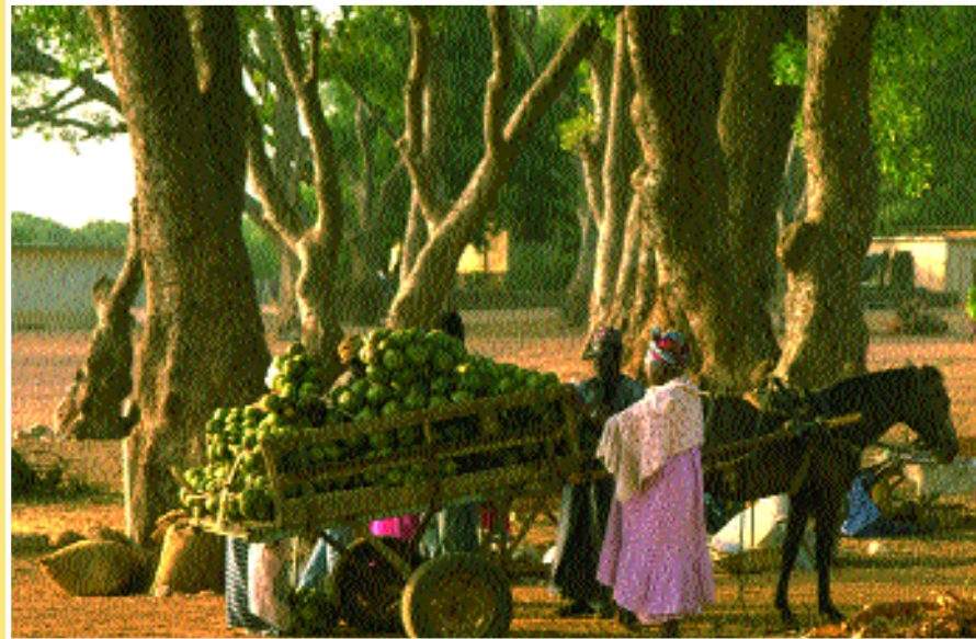
Selling palm fruits in Senegal. Tree and forest products often play an important role in local livelihood systems.

The literature on community forestry tends to focus primarily on experiences that involve some form of collective management of a forest resource by the local population. However, as is evident in the categories of user/resource relationship described above, and the discussion in Chapter 2, community forestry can equally involve activities on an individual, or on an individual household basis, such as tree growing on farms or small-scale processing and trading of forest and tree products. Moreover, there are no clear-cut boundaries between the different forms that community forestry takes. Many people who draw upon collectively used forest resources for some of their needs also create or maintain tree resources on their farms. Individual producers may also come together in collective groupings, such as cooperatives.