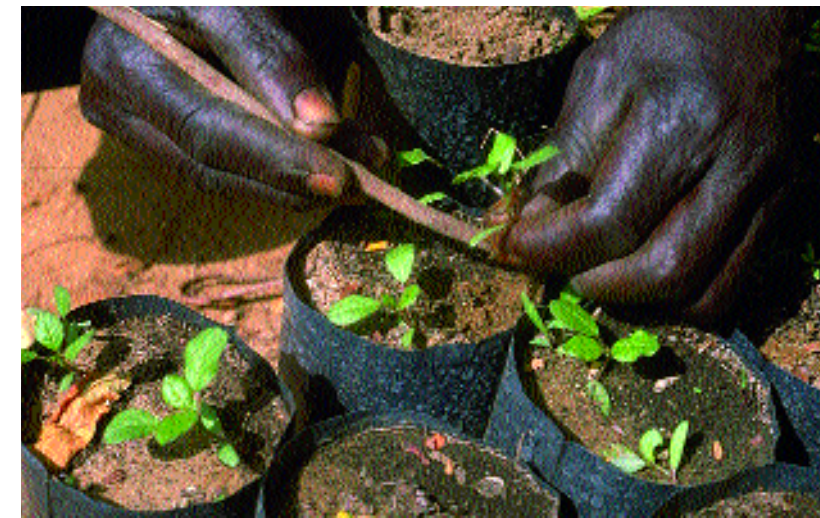
Eucalypts grown for industrial users. Forest industries in many parts of the world draw a large part of their wood and fibre raw material from small growers, generally farmers.

In recent years, there has also been a revival of interest in developing schemes to enable farmers or the landless to grow trees on public land. In the past, a number of countries ran taungya programmes, under which farmers were temporarily allocated plots on public forest land on which they were allowed to cultivate agricultural crops between