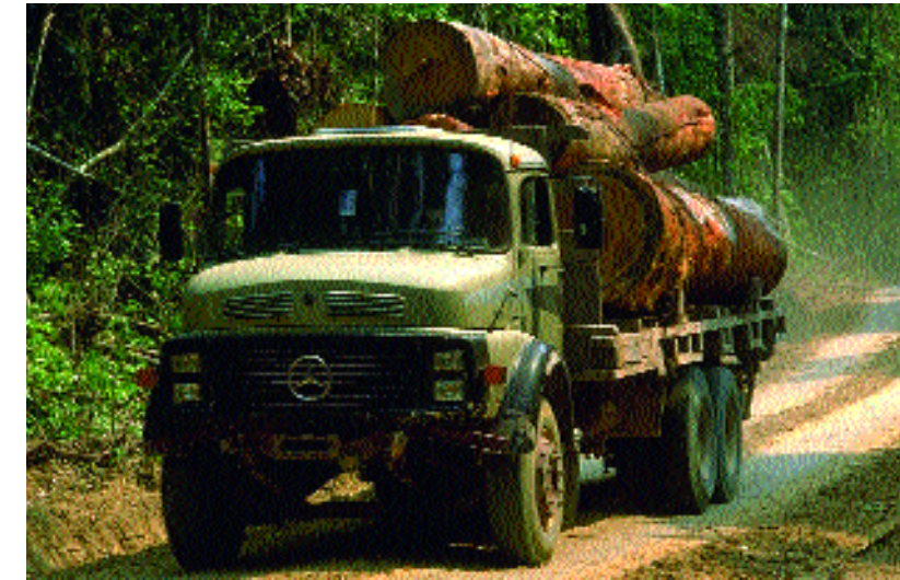
An important advance in community forestry in Latin America has been the inclusion of timber in resources available to communities for exploitation.

Restrictions placed on forest use in order to protect forests brought into community forestry schemes and put under sustainable forest management can