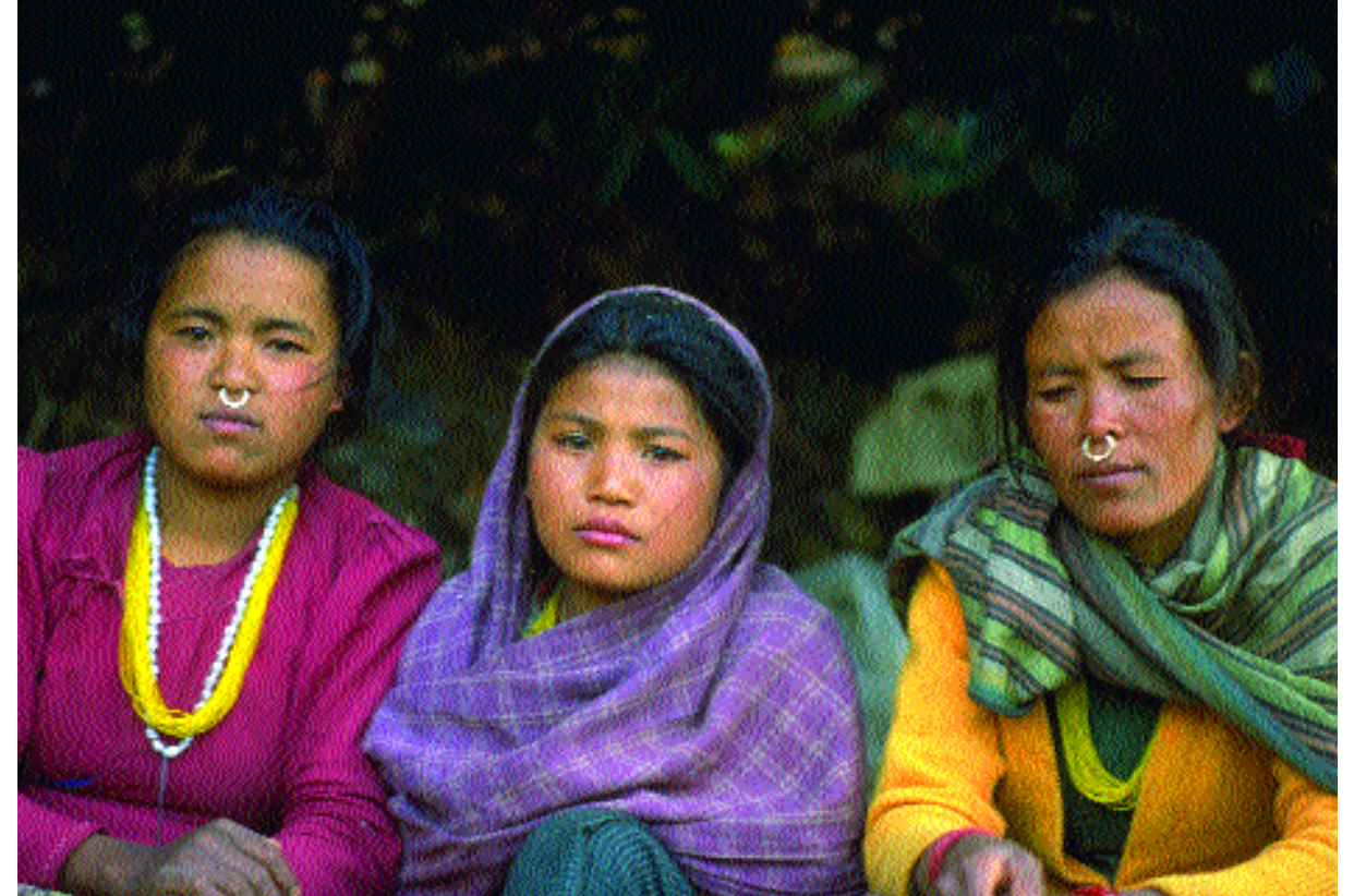
The particular needs and constraints that women face with respect to access to forest products and control over tree resources are all too often neglected.

Securing the rights of access of the poor to forest product resources in such fractured and often conflict-ridden communities has proved problematic. Exercises in participatory appraisal, relying on methods such as Participatory Rural Appraisal (PRA), which