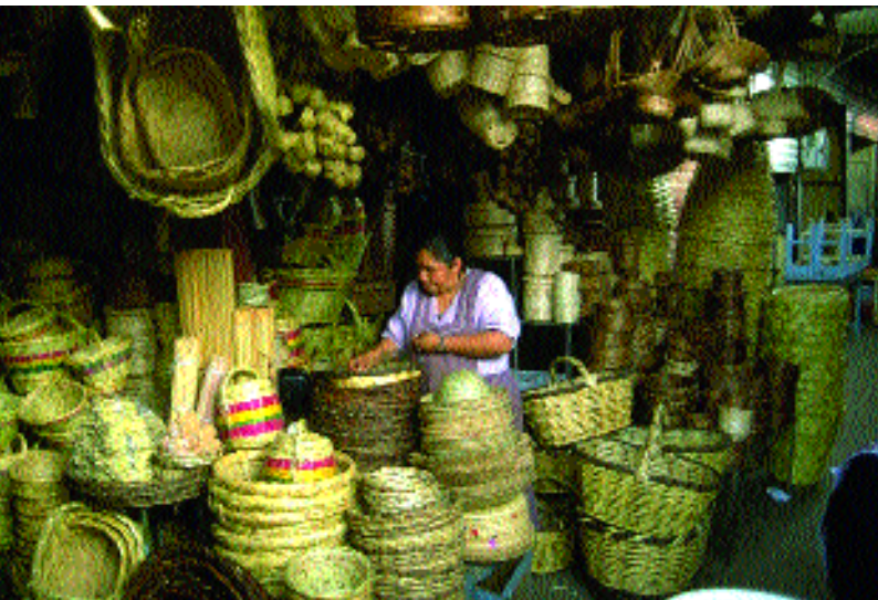
Wood products and handicrafts for sale in Bolivia. Interventions to support or encourage forest product enterprises need to be well informed about the realities of the commercial environment.

In short, much of the effort to date has not been focused in ways that are most likely to materially enhance the potential for forest product activities to contribute to rural livelihoods. Interventions to encourage or support greater participation in income-generating activities need to be better informed about the realities of the commercial environment within which people are being encouraged to operate. This applies equally to programmes to stimulate tree growing for the market. The abandonment of eucalypt growing by so many farmers in India was largely due to the farm forestry programme's failure to anticipate the limited size of the