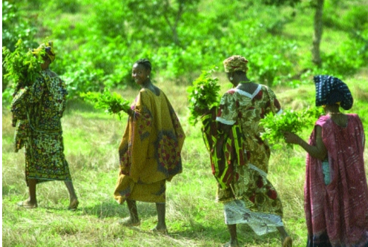
Women with medicinal plants in Guinea. Large numbers of rural households in developing countries are still subsistence users of forest and tree products.

give way to more productive and remunerative activities that meet growing and diversifying rural and urban demands. Production and selling of forest products thus increasingly shifts from being a part-time activity engaged in by large numbers of people to being a more specialized year-round activity that is carried out by a smaller part of the population.