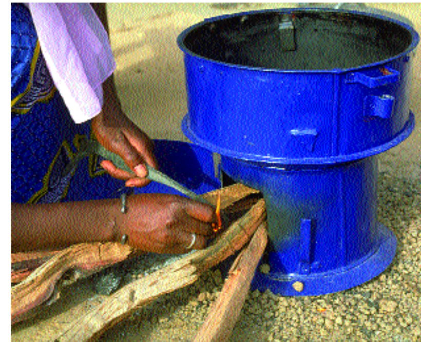
Many early community forestry initiatives focused only on increasing local fuelwood supplies.

Consequently, the very large-scale programmes that were often set in place to encourage and support tree growing by farmers, in order to increase local fuelwood supplies, often had disappointing results. Interventions narrowly focused on just one tree-related issue, such as fuelwood supplies, were likely to encourage tree growing where trees were not an appropriate component of the farm household economy, or to induce growing of inappropriate trees, or to require changes in the institutional or social framework that could not realistically be achieved in connection only with tree growing (Deweese, 1997).