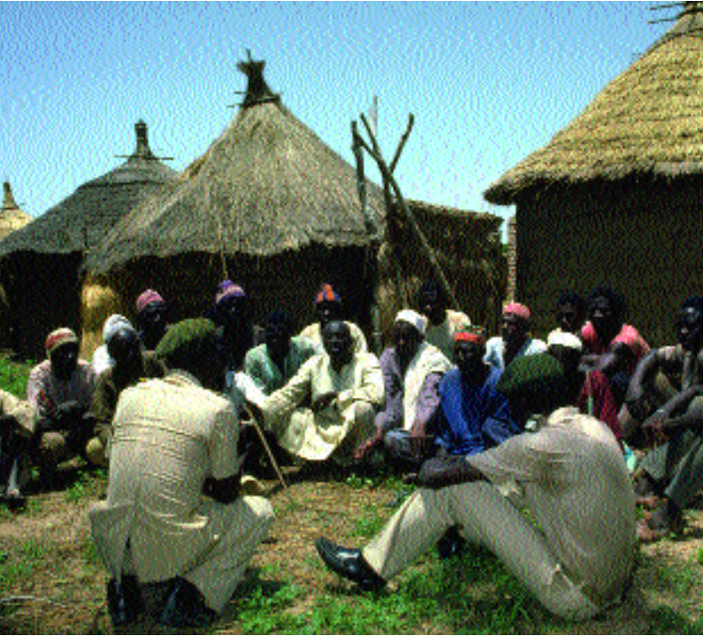
A forester meeting with a community group in Mali to help them develop a forest management plan.

for handling village forests. In practice, devolution either through leaderships or local government can mean that control and benefits are passed to local élites and outsiders.