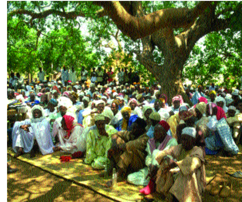
Different groups have, and always will have, different positions, opinions and objectives on sustainable forest management and rural development.

has accumulated yet to allow conclusions to be drawn as to what will succeed. Consequently, at present, the more innovative and forward-looking collaborative programmes contain a substantial element of experimentation, as is further discussed in Chapter 4.