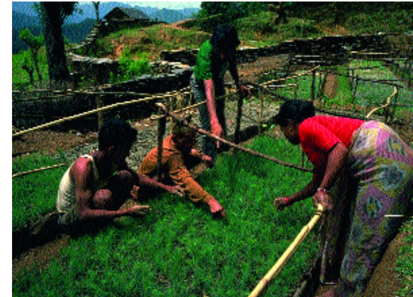
Villagers working in their tree nursery.

Where the land to be allocated previously had other uses, as was the case with the 'tree patta' leases on village land in India, other issues can arise. If there is insufficient cultivable land available to make it