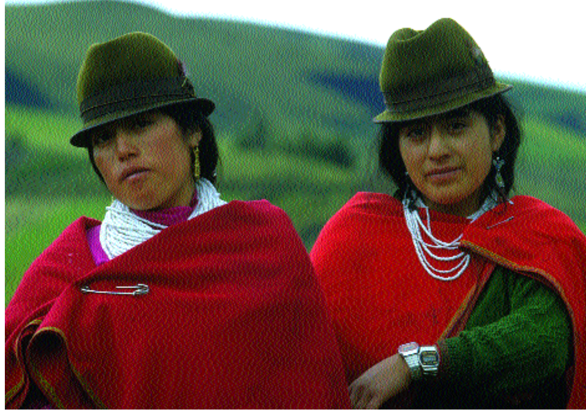
Community forestry is changing to become more effective and responsive to local needs and aspirations.

encourage more flexibility and willingness to adapt to the particular attitudes, needs and constraints encountered in each location. For instance, the experience with JFM projects in India has shown to what extent progress and performance relate to the ability of individual officials to establish a rapport with the people with whom they work, and to adapt standard procedures to what is needed locally (Vira, 1997).