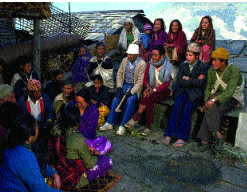
Villagers in Nepal meeting to decide what kinds of trees to plant.

By January 2000, there were 8 900 registered forest user groups (FUGs), managing 652 000 ha of forest, and many more were waiting to be registered. User groups are now coming together and forming larger