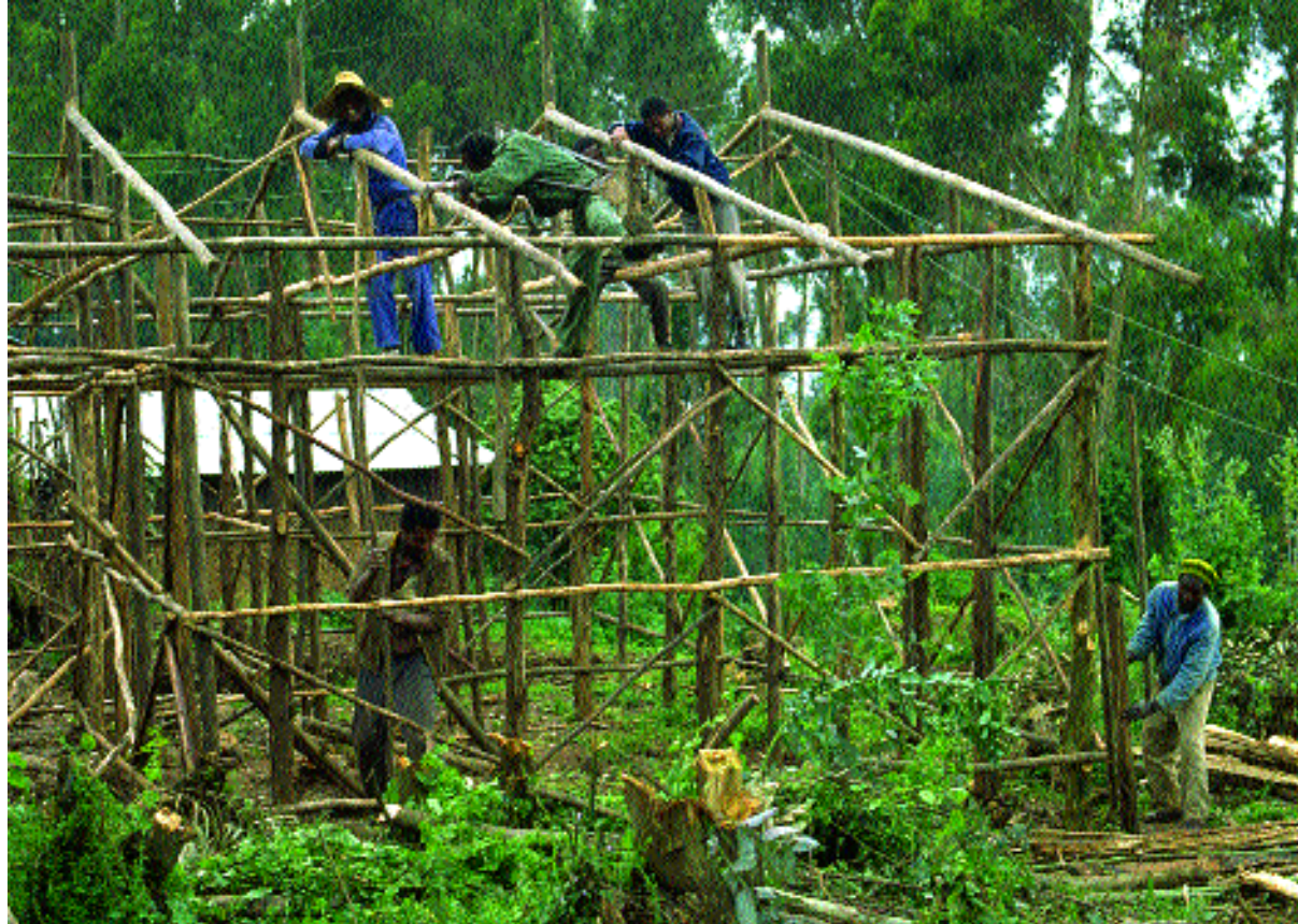
Building a house with eucalypt poles.

that kept fuelwood prices artificially low. Small producers proved to be at a further disadvantage in selling to industrial and urban markets because the size of supplies from State forests and plantations often enabled them to capture advantages of scale in the negotiation of prices and in marketing agreements. Industries and traders preferred to buy from a few large suppliers rather than from a multitude of small, dispersed producers.