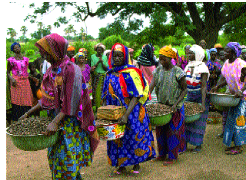
Women processing nuts that will be made into butter. Surveys in six African countries found that small forest product enterprises are often run by women.

The activities engaged in by the poor are likely to be labour-intensive, household-based processes, such as collecting and mat making. Many face weak market demand and strong competition. Such activities typically generate low returns, providing little, if any, surplus to invest in livelihood improvement, and they are often tedious and arduous. Therefore, they are likely to be abandoned as more rewarding and congenial alternatives become available, or as rising incomes lead to displacement of the product in the market by