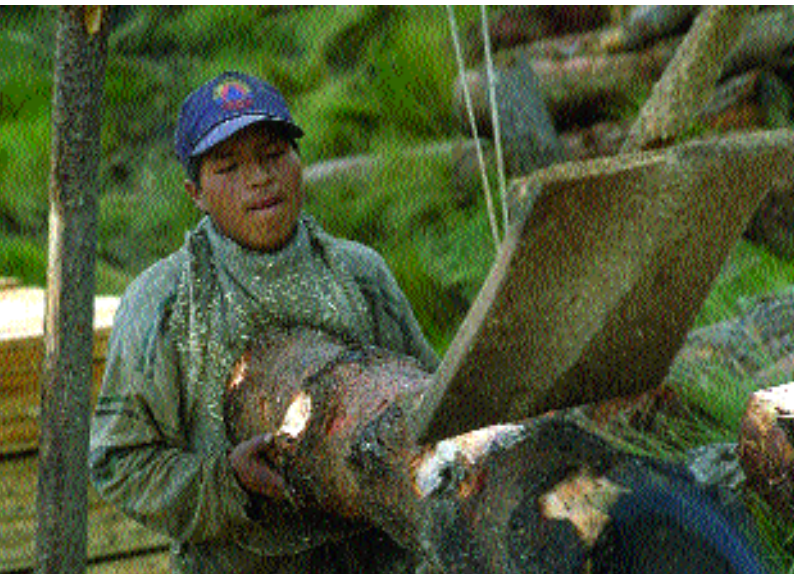
Smallholder timber forest management for commercial purposes has proved to be viable on scales from as little as 20 ha in Ecuador.

These agroforest systems often occur in areas in which village lands and surrounding forest lands have traditionally been managed as common property, with smaller extended family groups controlling access to planted trees that is based on descent from the earlier planters, and with individuals having private property rights to trees they have planted. As the commercial importance of products increases, rights to use particular trees controlled by descent groups is often vested in individuals, if only temporarily, in order to facilitate timely decisions on