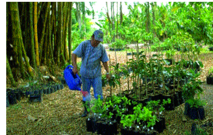
An experiment to reproduce wild fruit-trees in Brazil. Farmers in forest areas often develop tree management systems based on components of the forest.

F armers living in, or on the edges of, forest areas often develop tree management systems based on components of the forest. This can take the form of retention of parts of the forest cover, within or adjacent to areas put under crops, to be managed for particular products, or enrichment of the forest to increase the density of tree species of value. Prominent examples of enrichment systems include the açai and babaçu palms in parts of the Amazon basin (Anderson and Ioris, 1992; May et al. , 1985), indigenous fruit species in the forest belt in West Africa (Falconer, 1990), and